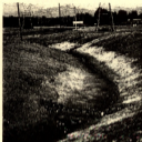
Swale with Check Dam

An alternative to these traditional diversion methods is the use of movable, or continuous berms. Continuous berms are geotextile tubes filled with sand or dirt, used similarly to traditional berms. They are machine-spread and can be used repeatedly. They accomplish the same task as traditional berms or dikes, but are slightly more expensive.